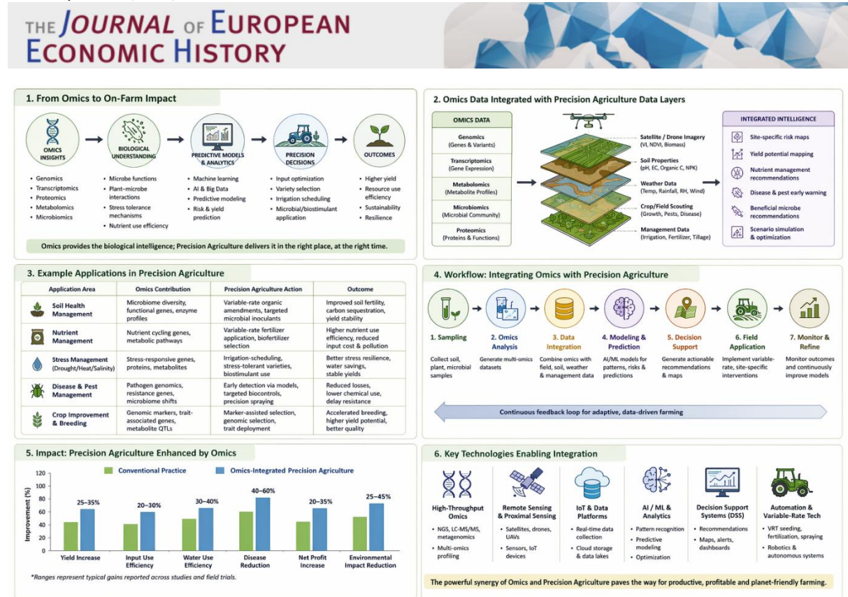
Figure 3: Integration with Precision Agriculture